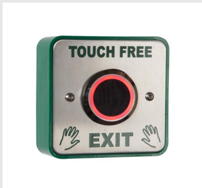
Surface or flush mountable, single gang "TOUCH FREE" exit device, 12/24vdc, illuminated GREEN going RED, door open time 0.5 to 20 seconds, operational 3 to 12 cm.