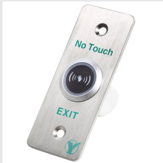
Flush mountable, narrow style, "TOUCH FREE" IP65 exit device, 12/24vdc, illuminated GREEN going RED, door open time 0.5 to 20 seconds, or toggle mode.

Help prevent the spread of COVID-19 by replacing all contactable exit devices, used in access control and door automation systems with one of these user friendly "CONTACT FREE" exit devices.