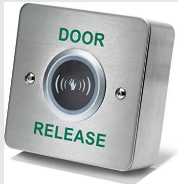
Surface mountable, single gang "TOUCH FREE" IP65 exit device, 12/24vdc, illuminated GREEN going RED, door open time 0.5 to 20 seconds, or toggle mode.